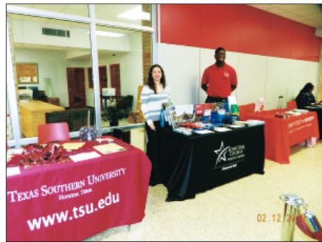
Information Booths were set up for consultations with prospective students, both before and after the formal talks in the auditorium of MacArthur High School.