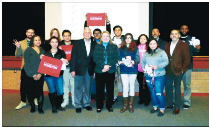
Students who attended Congressman Green's College Financial Aid Workshop were eligible for a drawing for scholarships. These students received the awarded scholarships. At the front are Congressman Gene Green and State Senator Sylvia Garcia.

College aspiring students from schools throughout Congressional District Texas-29 attended Congressman Gene Green's annual "Paying for College Workshop" held last Monday night, February 22nd at MacArthur High School in Aldine.