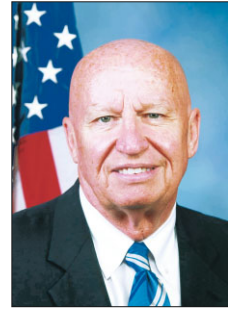
U.S. Rep. Kevin Brady

"Today's economy is full of opportunities and Lone Star College is helping small-business owners seize the moment and compete," said Brady. "This is a tremendous opportunity for all of our local small businesses and I am looking forward to being part of it."