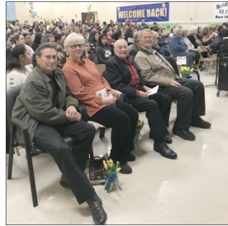
The Mendel Family.