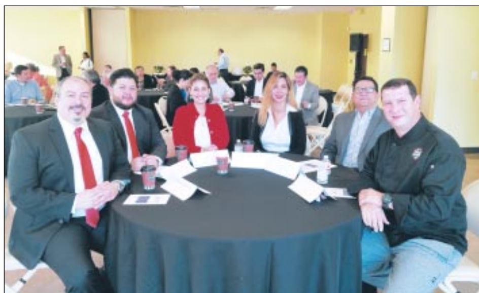
Participantes de la categoría LANZAR