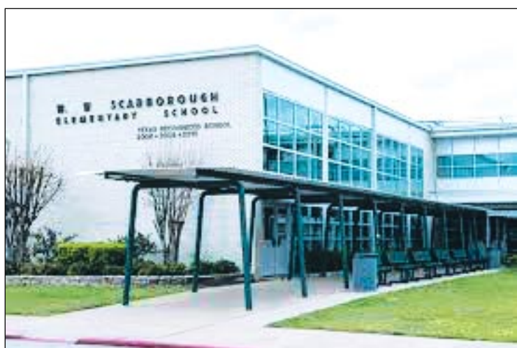
Scarborough Elementary school, one of the 4 four Houston ISD most damaged schools by Harvey to be rebuilt.