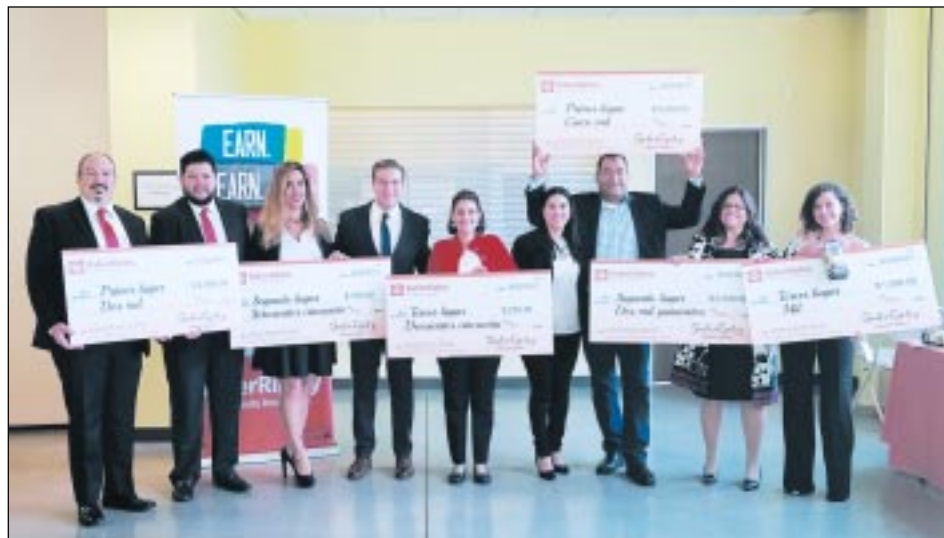
Los ganadores de ¡Lánzate Houston!

Para obtener más información sobre BakerRipley y cómo podemos ayudarle con su negocio en cualquier industria, comuníquese con el programa de Conexión de Emprendedores al teléfono 346-226-1591.