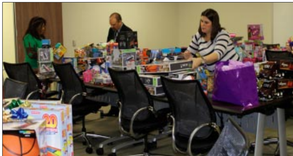
Pictured are members of Aldine ISD's Human Resources Department preparing the toys prior to distributing to Mendel students.

Students at Mendel Elementary who were displaced by Hurricane Harvey were treated to an early Christmas when each student received Christmas toys thanks to Dansville School District in Dansville, New York. Mendel students had to be moved to new campuses (Garzia-Leza and Green-