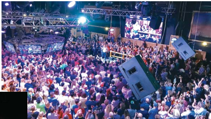
ABOVE, Several thousand enthusiastic supporters gathered last Saturday in the Escapade Club on the Eastex Freeway, to hear Beto O'Rourke, candidate for the U. S. Senate, speak on issues that make up his campaign. At LEFT, Beto spoke for about 45 minutes on important issues, saying Texas deserves an accountable, full-time Senator who is committed to working tirelessly for the citizens of the state. Beto is running against incumbent Senator Ted Cruz.