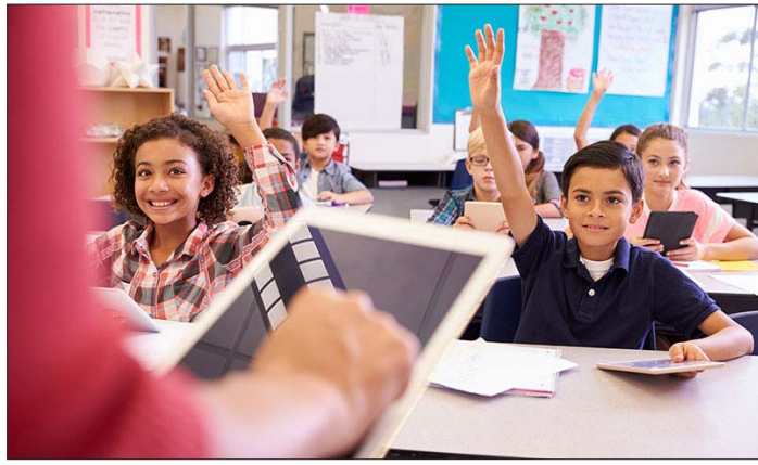
Cutline: Aim for 100% attendance for a better future for your child.

Absences Add Up: The building block that must be in place to meet student achievement and high school graduation goals is attendance.