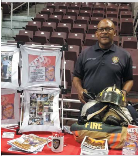
Firefighters were present to provide basic safety information, and answer questions on the operation of the fire department.