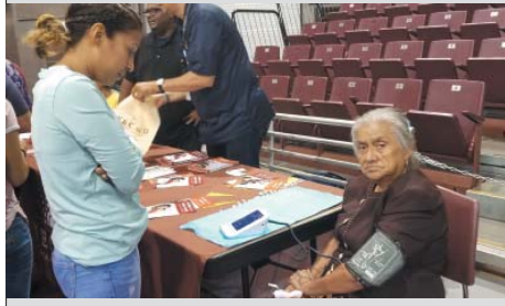
Health Screening was available, for blood pressure and sugar checks.