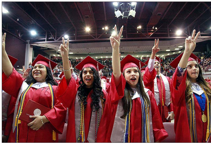
MacArthur graduating class of 2018

About 22 percent of the 2.2 million students worldwide who took AP Exams performed at a sufficient high level to also earn an AP Scholar Award.