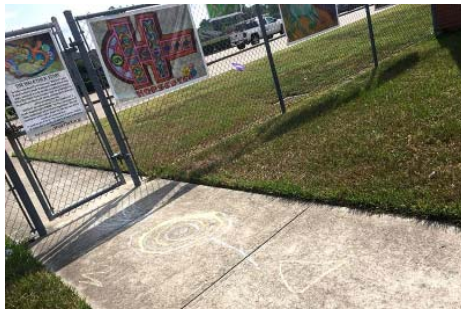
Kujawa Elementary School kicked off the new school year with "Walk The K!" project.

The sidewalk project launched earlier this year at Kester Elementary School in Sherman Oaks, CA. According to a press release, the Kester "Walk The K!" project was made possible by Let's Play Everywhere LA, a citywide competition held by Ka-BOOM!, Let's Play (an initiative by Dr Pepper Snapple Group) and the City of Los Angeles Mayor's Office. The competition awarded grants to fund creative solutions that make play a way of