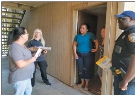
North Houston District, HPD, Sheriff's Office and Community Partners unite to keep district safe knocking out crime one talk at a time.

(HOUSTON, TX, Sept. 20) - During the hot, 100 degree summer days, members of the North Houston District Public Safety Task Force made multiple rounds by foot at apartment communities along Northborough Drive in Greenspoint as part of the Northborough Initiative Knock and Talks. The initiative, launched by the North Houston Management District in May, is a proactive approach to re-