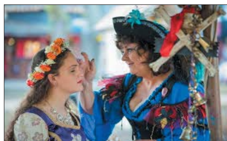
Texas Renaissance Festival festivities are held at Todd Mission, 50 miles north of Houston.