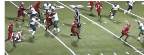
MacArthur RB#2 breaks open in the game against the Klein Forest Golden Eagles.