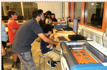
A young boy learns how to laser cut a pumpkin design from orange acrylic plastic in the FabLab.

...fice, Brookside Funeral Home, Lone Star College, ESD#1, Westfield Fire Department, MacArthur Generals, MacArthur 9th grade, and Castlewood, High Meadows, and Green Forest Civic clubs. Chick-fil-A provided 400 sandwiches, which were gone quite quickly.