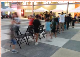
Musical chairs was one of many games.