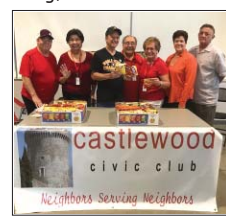
Civic Clubs each had a display and greeters