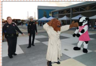
Deputies dance with McGruff the crime dog, and the Chick-fil-A mascot.