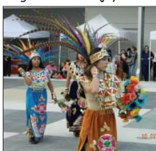
Costumed Dancers from MacArthur 9th grade.