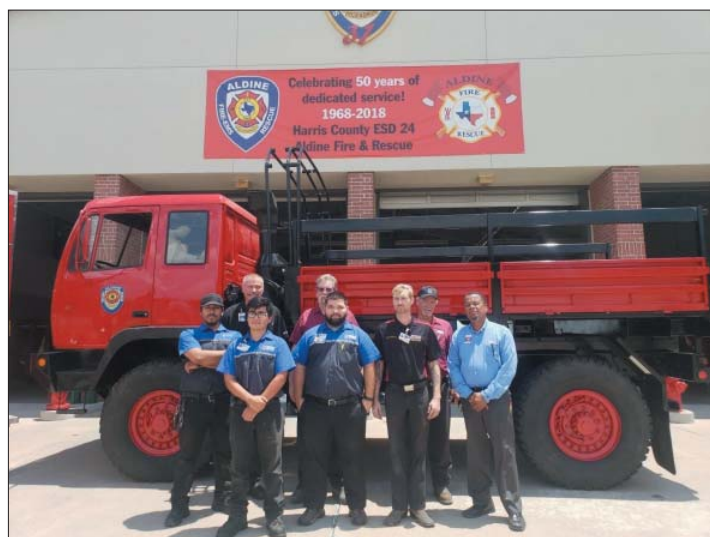
UTI Houston students and instructors with completed vehicle in front of Aldine Fire & Rescue #31.

Universal Technical Institute (UTI) Houston and Aldine Fire Station #31 recently partnered on a