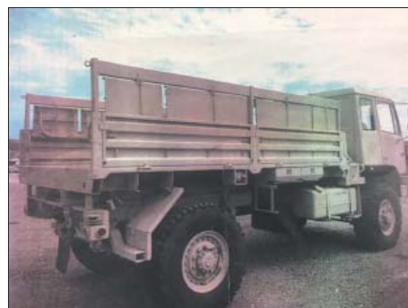
Original Military Vehicle before makeover

ing in the community, UTI students are training to work in a high-growth industry with significant job and career opportunities.