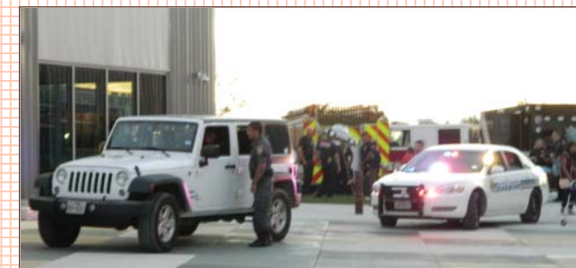
Sheriff's deputies demonstrate how to act correctly and safely during a traffic stop.