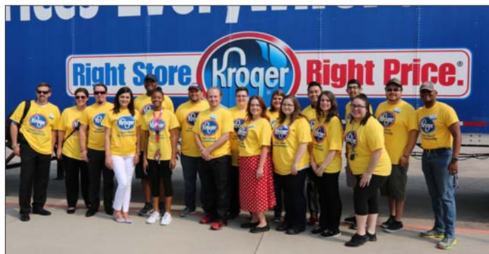
Team of Kroger volunteers helped distribute hams and other items at newest BakerRipley East Aldine campus.

The makers of the Hormel Cure 81 brand created the Hormel Cure 81