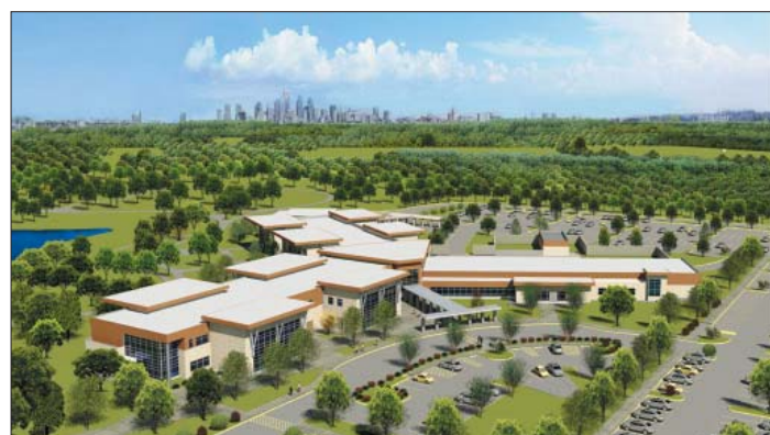
This is an architectural rendering of the East Aldine Town Center. Lone Star College-East Aldine Campus and Rose Avalos P-TECH School will share the facility. Avalos P-TECH School is accepting applications for current eighth-grade students for the freshman class of 2019-2020.

Aldine ISD is multiplying opportunities for high school students to earn a college degree and be career ready at no personal cost to their families in a partnership with the Lone Star Community College System (LSCCS) and industry partners. Through these partnerships, AISD