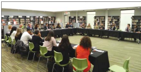
Representatives from a multitude of agencies met at Mead Middle School to discuss and coordinate education initiatives.