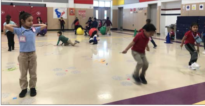
Students jumped rope raising money for the American Heart Association at Vardeman! We are so proud of all of our heart heroes they have been collecting money for the American Heart Association!! Students can still donate until March 1! Pandas are the best at Vardeman!!