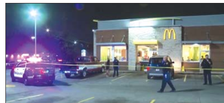
Officials at scene investigation fatal shooting at McDonald's.

HOUSTON - A man is dead after he was shot multiple times in the parking lot of a McDonald's in north Houston, according to the Houston Police Department.