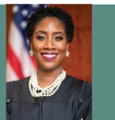
JUDGE GENESIS DRAPER HARRIS COUNTY CRIMINAL COURT AT LAW#12