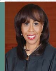
JUDGE STACI WILLIAMS SUPREME COURT OF TEXAS