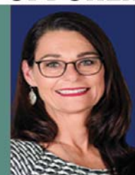
DEBORAH FLORUS HARRIS COUNTY CONSTABLE PRECINCT 3