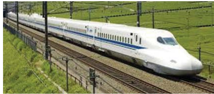
The TexasCentral train will be similar to this Japanese Bullet Train.

The high-speed train that promises to link Dallas and Houston within 90 minutes has been approved by the Federal Railroad Administration, according to Texas Central Railroad, the company in charge of the project.