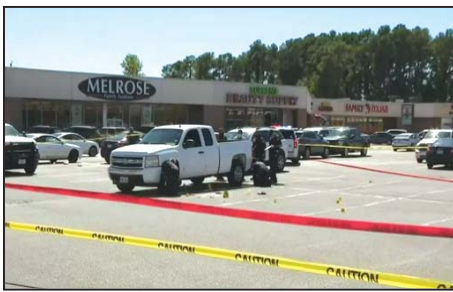
Investigators from the Sheriff's office examine the truck that was the target of the teenage carjackers.