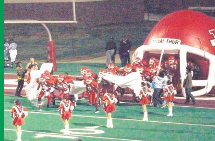
High School Football Season opens. See Schedules and Previews, Page 5

Serving the Neighborhoods of Aldine, Greenspoint, US59 Eastex, Beltway 8 and North Forest for over 44 Years VOL. 44, NO. 39 TUESDAY, OCTOBER 6, 2020 HOUSTON, TEXAS www.nenewsroom.com