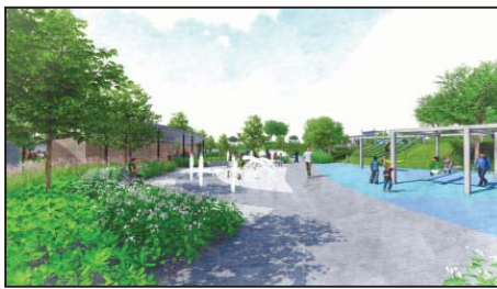
James Driver Park in Aldine.