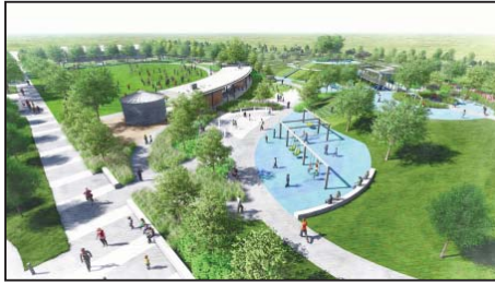
James Driver Park in Aldine. The first county-owned all-inclusive, fully accessible park.

Here's what to expect: James Driver Park will have widened walking trails that can accommodate two wheelchairs, side by side. The playgrounds will feature specially designed, wheelchair-friendly equipment where ALL kids can spin, sway swing, slide, and splash. It will have a misting area and plenty of shade for relief from our hot summer days, plus covered dining spaces. There will also be a sensory garden featuring indigenous perennials, an accessible event lawn for music and other entertainment, a designated area for taco and other food trucks, and so much more. We are so excited to debut the brand-new James Driver Park this summer.