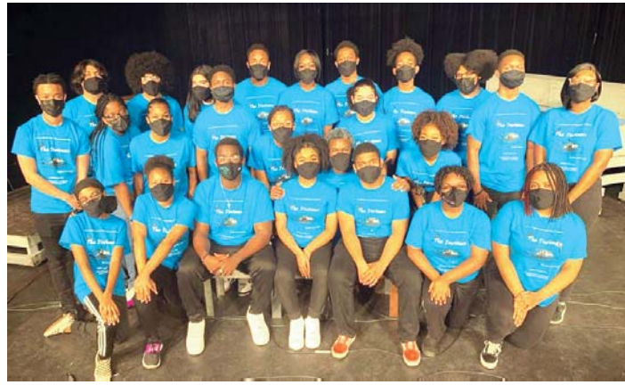
Carver HS' theater troupe advances to bi-district UIL one-act play contest. This is the 10th time in 11 years that the magnet school's troupe and students are named district champions.

Theater students from Carver High School competed in the Zone A and District 14 6A UIL One-Act Play contests. Based on their performances in The Diviners , the Carver HS thespians are advancing to the Bi-District Meet. The Carver troupe will compete again on Thursday, March 25, at Willis High School.