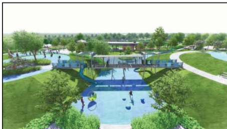
James Driver Park in Aldine.

James Driver Park isn't the only Precinct 2 park that is becoming more accessible. Going forward, most trails in our parks will be expanded to be six to eight feet wide to accommodate wheelchairs. We are upgrading playgrounds to offer more accessible activities such as an ADA-compliant zip line (Bay Area Park in Clear Lake). We've added more splash pads, inclusive swing sets (Burnet Park in the Lynchburg-area), roller slides (Stratford Park in Highlands), and ADA-accessible workout equipment (Highlands Park in Highlands, Crowley Park in East Aldine, and Riley Chambers Park in Barrett).