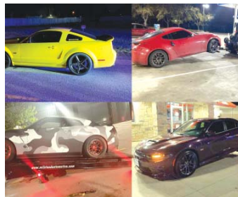
Deputies confiscated and towed 12 cars.

The arrests were the result of a joint initiative including the Harris County