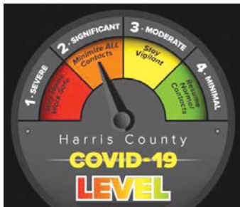
THREAT LEVEL for COVID-19 has been raised to Level 2 Orange - Significant; from Level 3 Yellow - Moderate.

Threat level 2 indicates a significant and "uncontrolled level" of COVID-19 in Harris County, meaning that there is ongoing transmission of the virus,