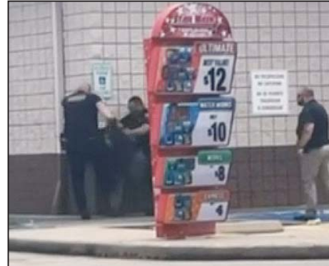
Sheriff's deputies, left, attempt to arrest a woman who resists, and they are seen punching and kneeling her violently in this video outrage on social media.

The deputies had initially been called to the gas station by the operators, who said the woman was creating a disturbance and would not leave.