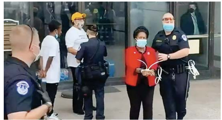
Capitol Police arrest U.S. Representative Sheila Jackson Lee and several others last week, for blocking the entrance to the Hart Senate Office Building. Lee was protesting in favor of action on Voting Rights bills.

WASHINGTON, DC – Congresswoman Sheila Jackson Lee was arrested Thursday during a protest in Washington D.C. where she was fighting for the expansion of voting rights.