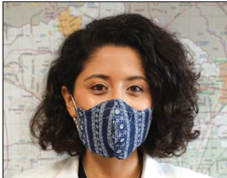
Harris County Judge Lina Hidalgo advises wearing masks and getting a vaccine shot.

The county judge called the latest surge a