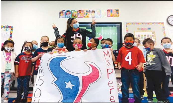
Students marched and paraded through the Vardeman Gym displaying Banners and pom poms!