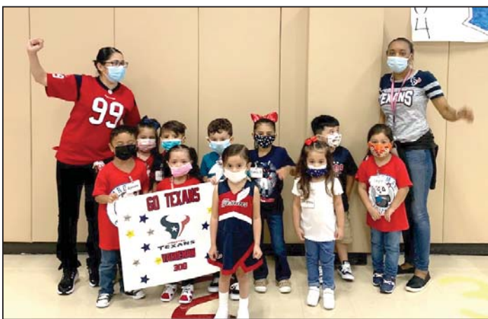
This event happens the Friday before the first home game for the Houston Texan Football Team.