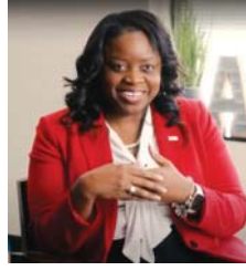
unos de nuestros líderes de Aldine que marcan la diferencia e impactan la vida de los estudiantes.

Estamos emocionados de continuar las celebraciones del Mes de la Herencia Hispana, que destaca los logros de los hispanos en todo el país y aquí mismo en nuestra comunidad. Durante el Mes de la Herencia Hispana, nos gustaría presentarles a al-