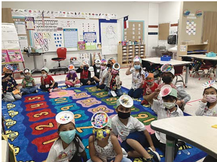
Students and staff at Vardeman EC/PK/K expressed their creativity by creating and wearing dots to celebrate Dot Day.