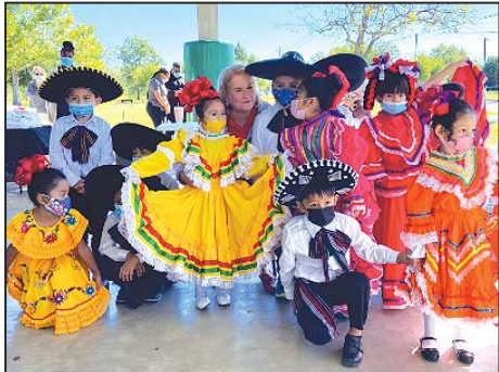
U.S. Representative Sylvia Garcia takes time to talk with costumed dancers at the Jubilee.