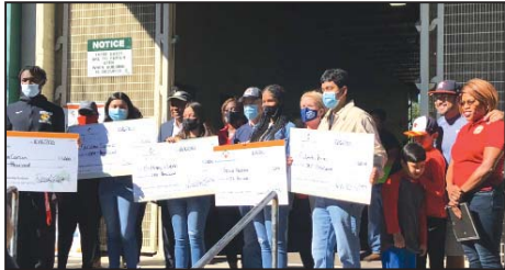
Five Scholarships of $1000 were presented by the UTPhysicians clinic. MORE PHOTOS ON PAGE 6