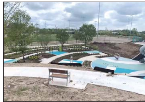
An "All Inclusive" park at James Driver Park in Aldine is an example of new thinking to accommodate persons with physical or cognitive disabilities.