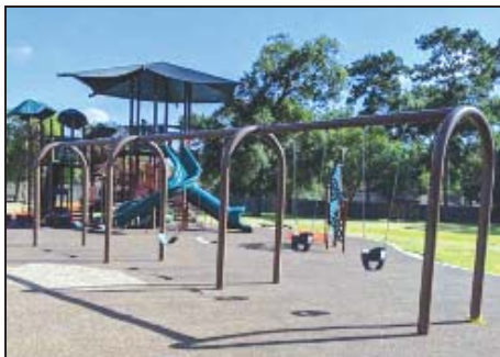
New exercise equipment at Highlands Park is an example of improvements underway at existing Pct. 2 parks.