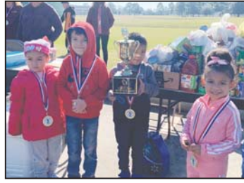
Vardeman Runners proudly displaying their medals from the Turkey Trot.