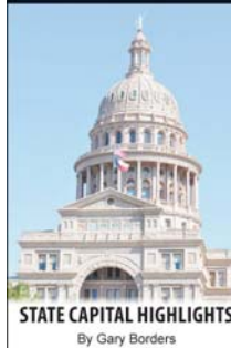
STATE CAPITAL HIGHLIGHTS By Gary Borders

Chronicle. The deaths and injuries occurred when a crowd rushed the stage as Scott performed.