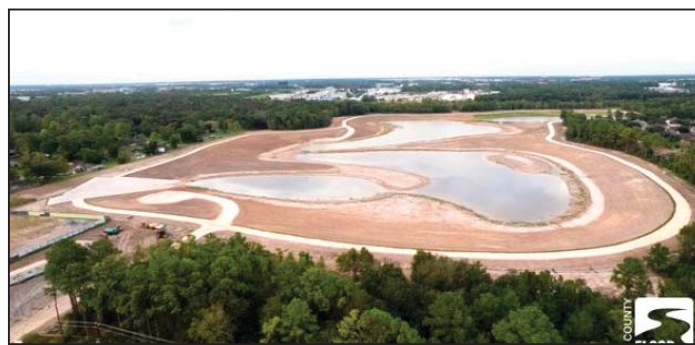
Harris County Flood Control District