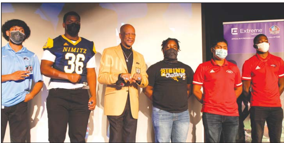
A group of Aldine ISD varsity football players pose with Pro Football Hall of Famer wide receiver Drew Pearson following Pearson's address to AISD student-athletes and Esports athletes at Eisenhower High School on Wednesday, Oct. 27.