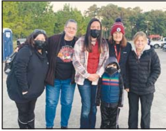
Teachers and Staff at Vardeman.