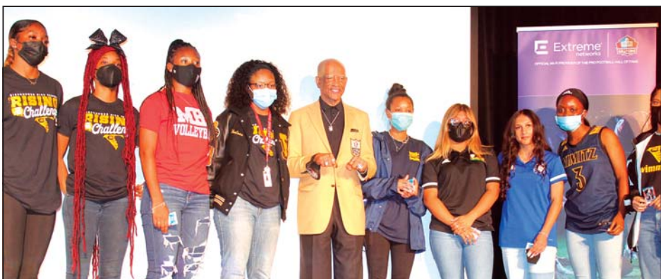
A group of Aldine ISD female student-athletes pose with Pro Football Hall of Famer wide receiver Drew Pearson after Pearson's address to AISD student-athletes and Esports athletes at Eisenhower High School on Wednesday, Oct. 27.