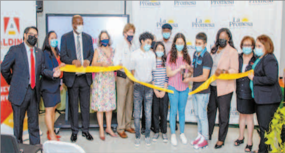
La Promesa students and district- and school-level leaders participate in the ribbon-cutting ceremony on October 5, 2021.

Learn More Visit lapromesa.aldineisd.org or call 281-448-5237 to learn more about the school and how to enroll for the 2022-2023 school year.