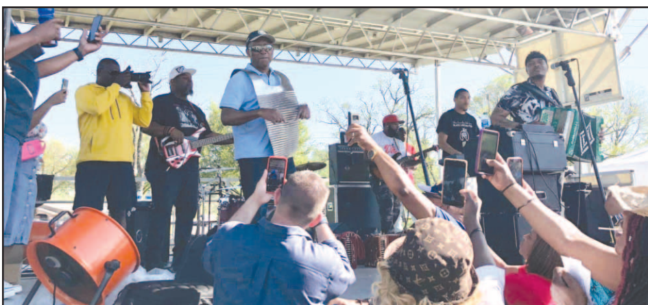
Mayor Sylvester Turner tries his hand at the Washboard during Family Day.