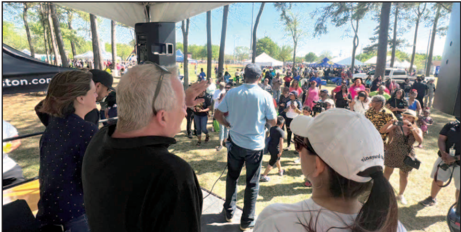
Mayor Turner and other city and state officials view the crowd from one of the three performance stages at the Family Day event.