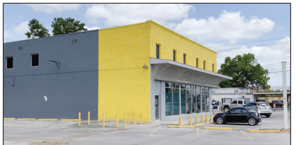
Named "ART in the HEART" the new studios and home of the HTX Art Bus will serve the East Aldine and Northeast Houston communities.