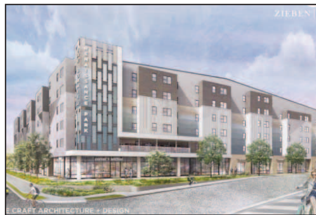
Architect's View of the 325 Housing Units to be built on the site of the Greenspoint Mall.

GREENSPPOINT – In July of 2021, the Houston City Council approved Summit at Renaissance Park, a 325-unit affordable housing complex on the Greenspoint Mall property.