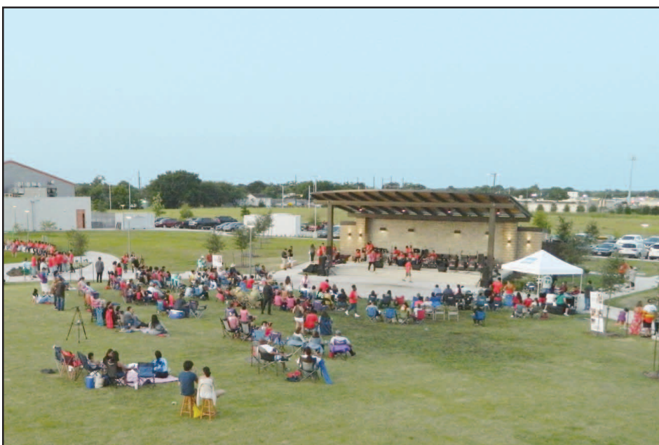
The SUMMER FAIR events will take place Saturday at the Town Center Amphitheatre and Park, and the kids' Splash Pad. Included are Free COVID shots, a Raffle for a Free TV and other prizes, Zumba, Face Painting, food trucks and entertainment. A great Family Fun event, don't miss it!