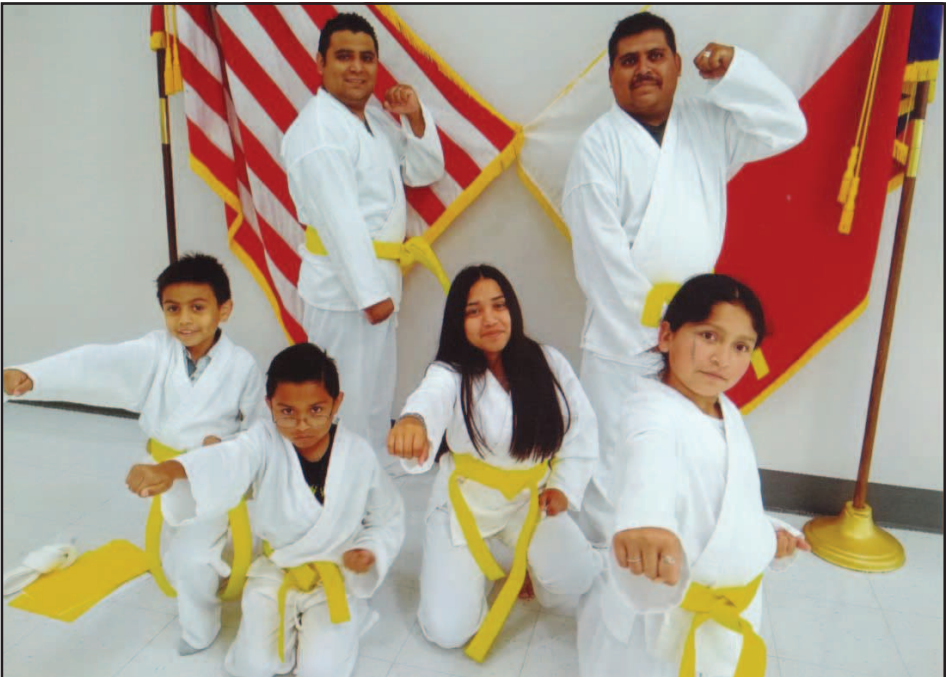
Hernandez family (brothers and cousins) celebrating at belt promotion ceremony