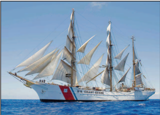
USCGC USS EAGLE under full sail. The Ship is now paying a visit to Galveston Harbor.

The Coast Guard Cutter USS EAGLE is now in Galveston Harbor, paying a public relations visit to the historic town for the first time in 50 years. It is one of only two American square-rigged sailing vessels in the U.S. Public tours were available last weekend, but long lines meant many folks simply looked on from a distance, and I might add, with awe. The 295 foot cutter, with its 3 masts and sleek lines, is a sight to see. And that brings me to my personal story about the first time I saw the ship.