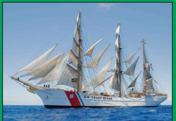
A Sailor's personal story, Page 4