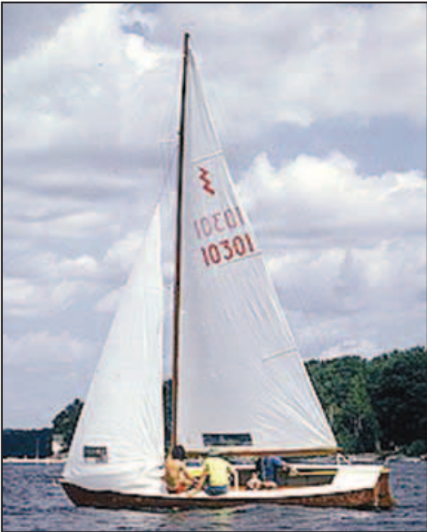
A 19-FOOT LIGHTNING DAYSAILER similar to the Publisher’s first sailboat.

But as we got farther out into the Sound, the fog lifted slightly and much to my amazement, it revealed a 3-masted, square-rigged cutter right out of the history books. Through the fog, I couldn’t believe my eyes. I did not know that