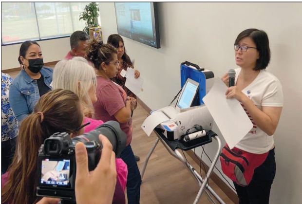
Learning about the new Voting Machines