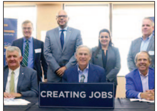
Governor Greg Abbott also appeared last week in Houston, choosing to speak to a small crowd of businessmen and officials at the Port of Houston conference room.

ernor and other state offices, Harris County Judge and commissioner, and many candidates for U.S. House and State Legislature.