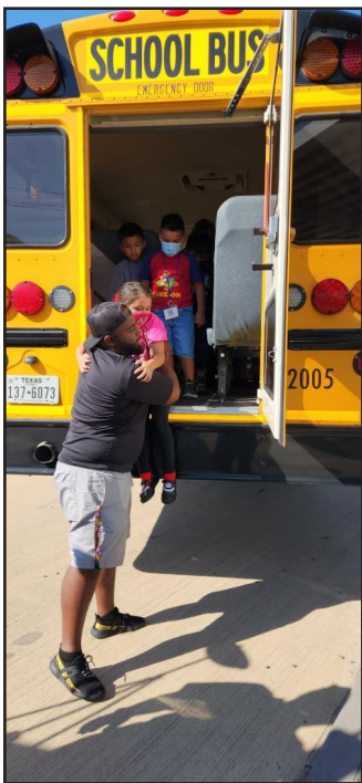
Students at Vardeman learned bus safety this week. The staff and students practice being safe while learning all about the school bus rules and how to evacuate a bus in case of an emergency!