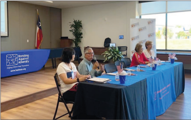
Speakers and B.A.A. officials

ALDINE – BAA (Bonding Against Adversity) held a seminar last week to give voting information. New sworn in citizens attended a Civic Engagement Roundtable on October 1, 2022. The roundtable which took place at the East Aldine District building was aimed at all citizens, encouraging them to register to vote. Several speakers attended to answer questions about the upcoming November 8 elections. A representative from the Harris County Elections Administrator was on site answering questions about polling locations, as well as doing demonstrations of the new voting machines; newly registered citizens had the opportunity to practice how to vote on the machines. Also, a representative from NALEO answered questions about the process to register to vote for new sworn in citizens, which requires extra steps such as reporting to the social security office administration and to the DPS in order to have an accurate count when voting. League of Women Voters - Houston, was on site as well reminding new citizens that deadline to register to vote is October 11, 2022. Questions were answered and prospective voters are getting ready to choose their candidates on November 8, 2022.