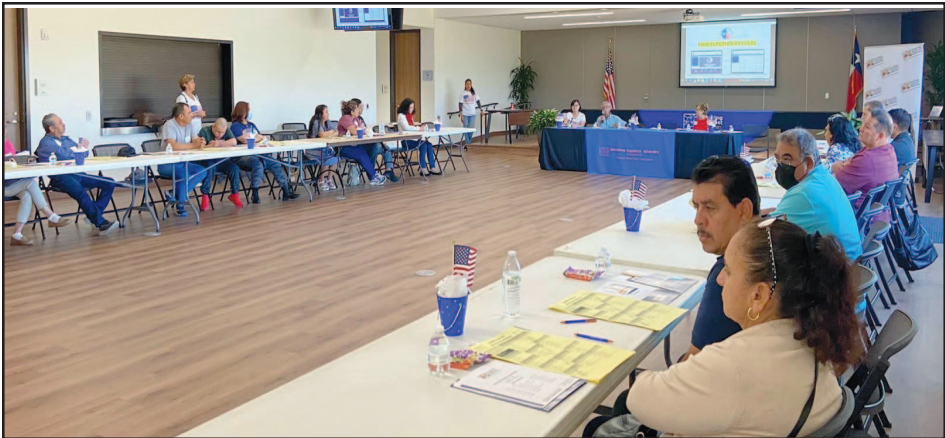
Roundtable discussion at the East Aldine offices