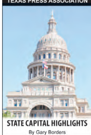
STATE CAPITAL HIGHLIGHTS By Gary Borders