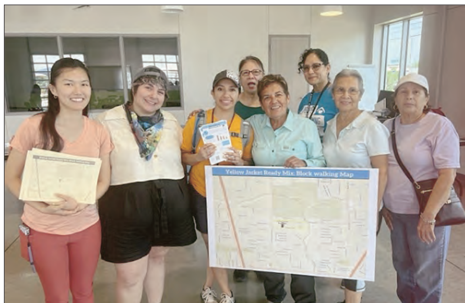
Aldine Residents, members of the Green Forest Civic Club, and others who spoke at the TCEQ hearing to oppose the Yellow Jacket Readymix Application.

The company had sought TCEQ permission to add the silo at 2219 Hartwick, between Aldine Westfield Road and Halls Bayou. The facility sits close to several private