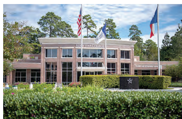
Lone Star College System offices in The Woodlands