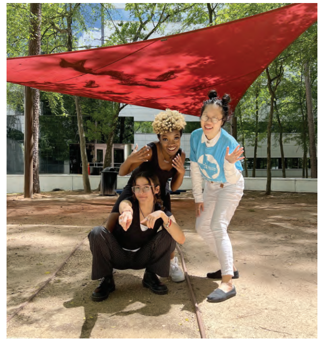
Don't let summer slip by – enroll in summer courses today. Lone Star College-University Park offers a broad range of academic programs this summer for anyone wanting to jump start, continue or complete their education.