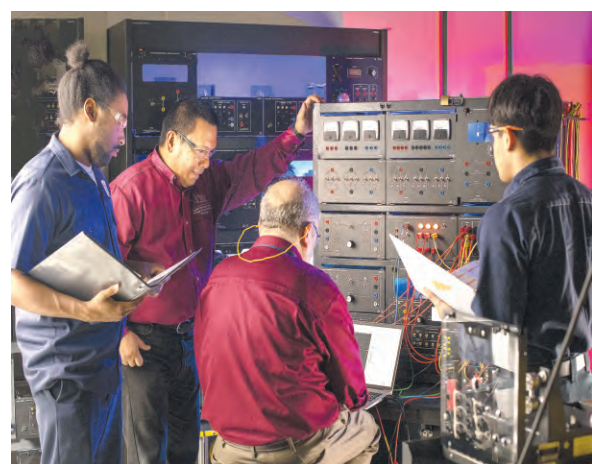
Lone Star College partnered with the Texas Workforce Commission to offer the Skills for Small Business program that provides area employers with free training for their employees.

The Lone Star College Skills for Small Business project is financed with $15,000 (40.81% of the total costs) of federal money. 0% of the total costs of this project are financed by nongovernmental sources. For more information on the