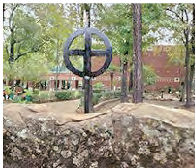
Lone Star College-Montgomery will unveil its Land Acknowledgment Monument Nov. 29 at noon in the Garden Area. The event offers attendees a glimpse into the Alabama-Coushatta Tribe culture, who previously inhabited the land that now sits LSC-Montgomery.

Lone Star College-Montgomery celebrates Native American Heritage Month with monument