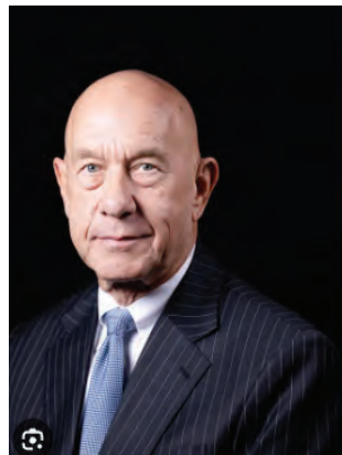
MAYORAL CANDIDATES JOHN WHITMIRE & SHEILA JACKSON LEE

The city of Houston has become accustomed to run-offs in their mayoral elec-