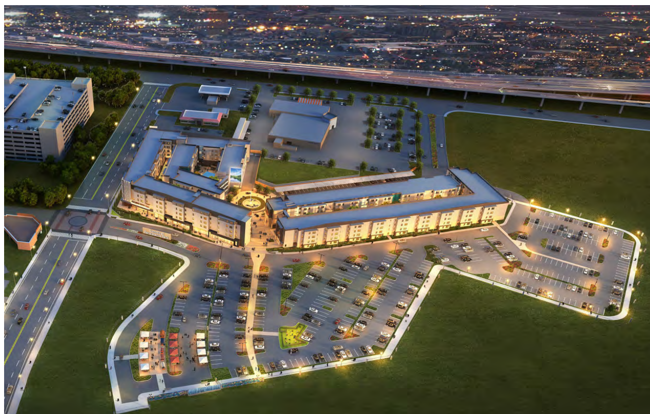
The Summit at Renaissance Park is built on the site of the former Sears Auto center. Amenities include a children's playscape, community gardens, sky lounge pool with sun deck, rentable community space, a dog park, fitness center and yoga studio.

Zieben Group invests in and develops residential and commercial real estate projects throughout Texas. Zieben Group is a vertically integrated company with acquisitions, development, construction, property management and asset management divisions. They use their extensive experience to identify and respond to development and acquisition opportunities at strategic points throughout the real estate cycle.