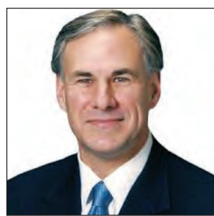
Texas Governor Greg Abbott

tion experts point out both federal and state law already required voter roll maintenance and that this is a routine process.