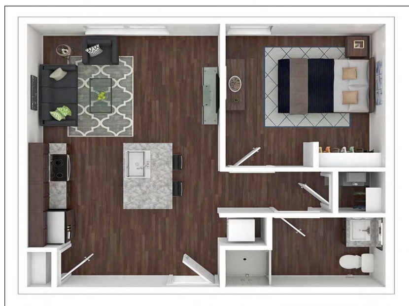
LAYOUT OF A TYPICAL ONE-BEDROOM APARTMENT.

They use their extensive experience to identify and respond to development and acquisition opportunities at strategic points throughout the real estate cycle.