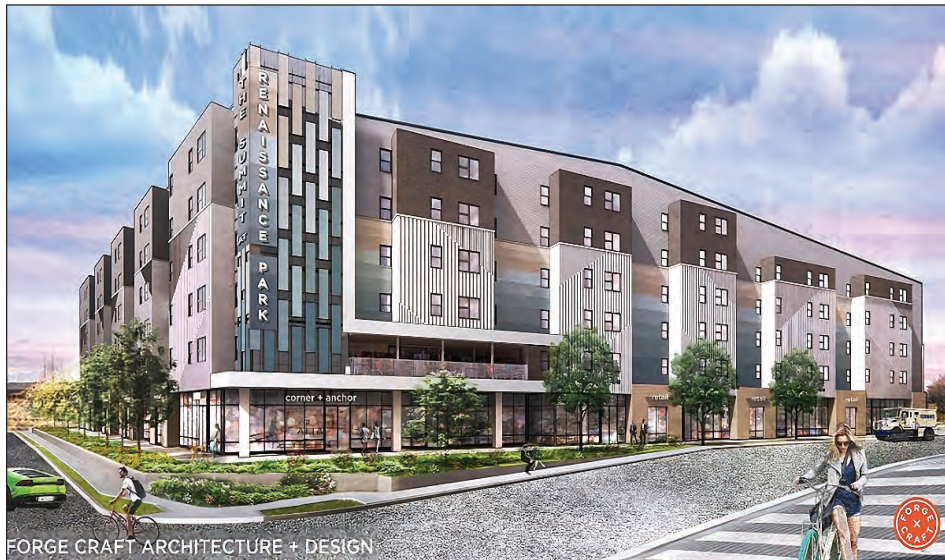
View of the Summit at Renaissance Park apartments, ready for leasing. The project is built on the former site of the Seats Automotive building on the Greenspoint Mall property. The project includes 325 apartment units, ranging from one bedroom to four bedroom units, with subsidized rent ranging from $480 per month, to $1,537.

ben Group, the four-story complex will be on the southeastern portion of the mall property. The rent for the one- to four-bedroom, 606- to 1,259-square-foot apartments depends on income and ranges from $480 to $1,537 monthly.