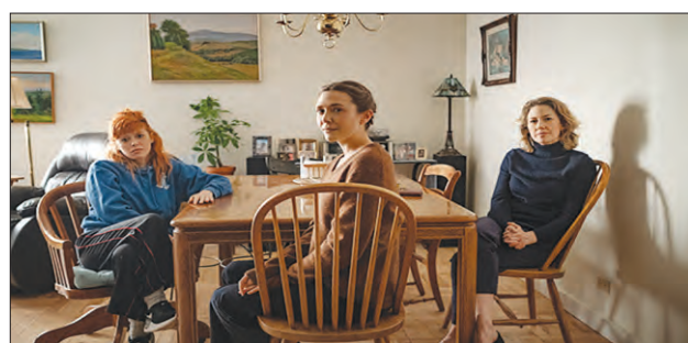
From left, Natasha Lyonne, Elizabeth Olsen and Carrie Coon star in "His Three Daughters."