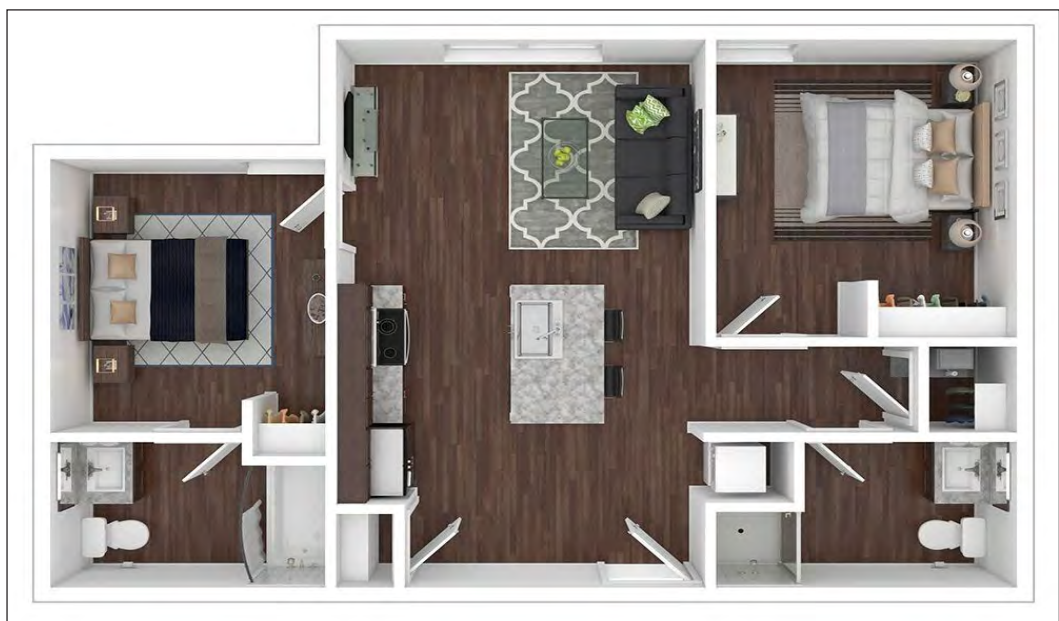
LAYOUT OF A TYPICAL TWO BEDROOM APARTMENT.