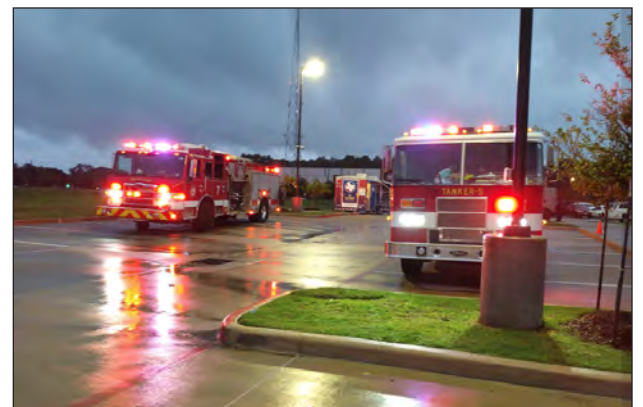
WESTFIELD FIRE DEPARTMENT FIRE TRUCKS