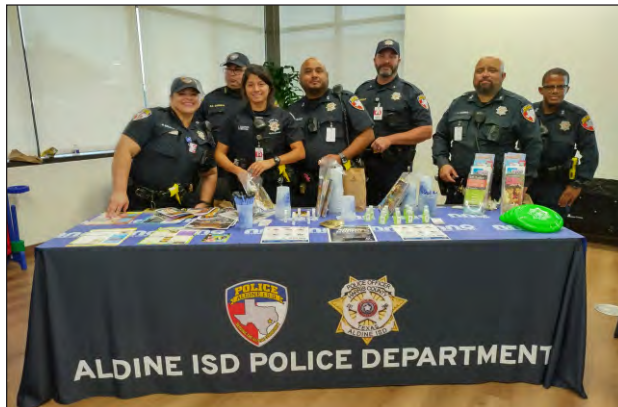
ALDINE ISD POLICE WERE ONE OF SEVERAL DEPARTMENTS PRESENT

Continued. See NATIONAL NIGHT OUT, Page 5