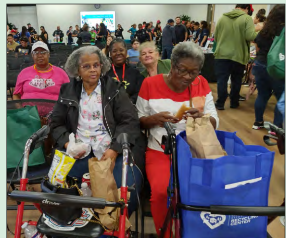
SENIORS FROM PILGRIM PLACE