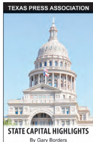
STATE CAPITAL HIGHLIGHTS By Gary Borders

The Farm, Food, and National Security act is considered a "must-pass" piece of federal legislation. The bill supports more than 230,000 farmers and