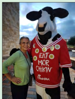
CHICK-FIL-A MASCOT WITH MARINA SUGG