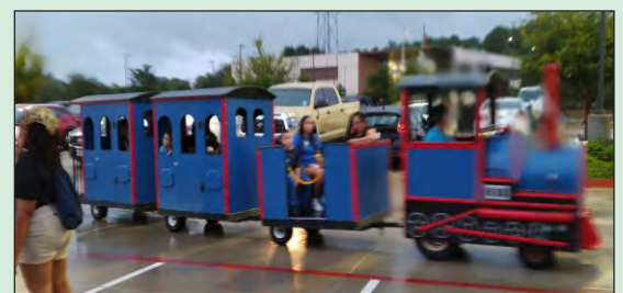
KIDS ENJOYING A TRAIN RIDE