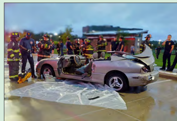
JAWS OF LIFE DEMONSTRATION