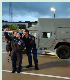
HCSO EXPLORERS AND JEEP