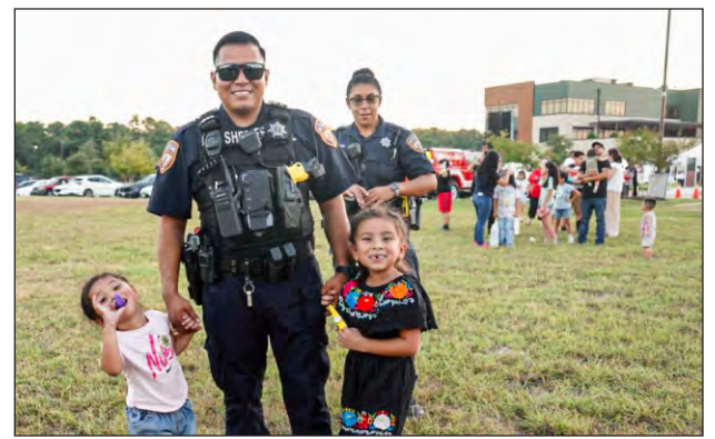
TWO LITTLE GIRLS GET TO MEET A DEPUTY