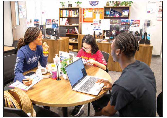
Spring 2025 registration for Lone Star College System begins Monday, Oct. 14. Learn more at LoneStar.edu/Start.

“I am grateful to Lone Star College System for providing life-changing