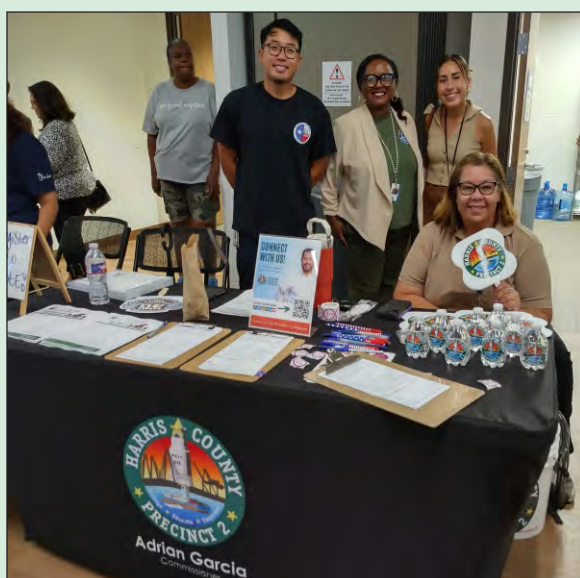
PRECINCT 2 INFORMATION DESK