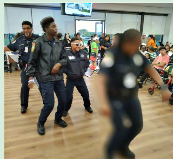
OFFICERS CAN DANCE... HMMM.