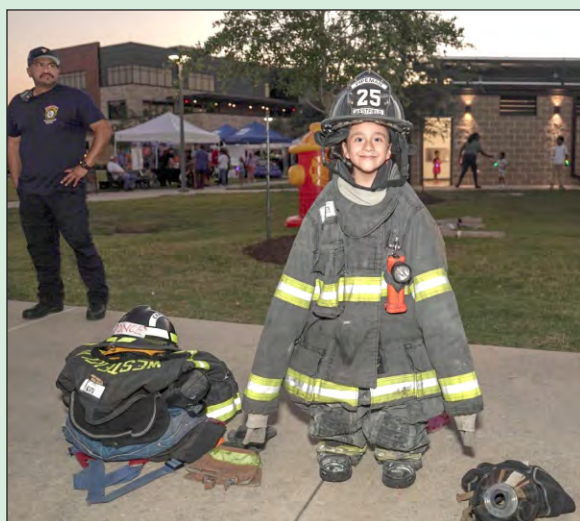
A FUTURE FIREFIGHTER.

Thank you to everyone who made this year's National Night Out a success. Together, we are making Harris County a safer, more connected community.