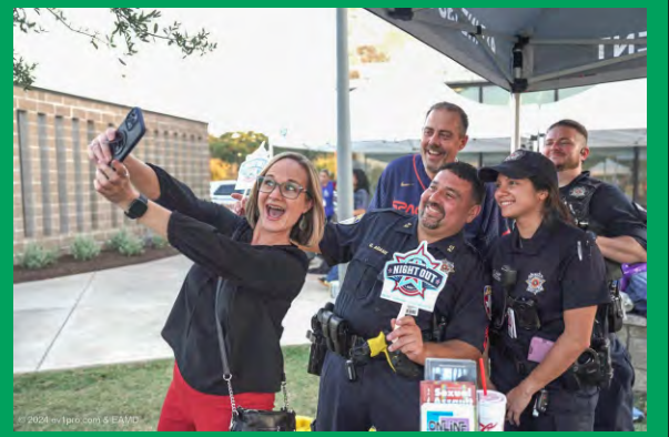
FOLKS TAKE A "SELFIE" WITH THE EMERGENCY CORPS AT NATIONAL NIGHT OUT IN EAST ALDINE. SEE BELOW, AND PAGE 5.

Serving the Neighborhoods of Aldine, Greenspoint, US59 Eastex, Beltway 8 and North Forest for over 48 Years VOL. 48, NO. 39 TUESDAY, OCTOBER 15, 2024 HOUSTON, TEXAS www.nenewsroom.com