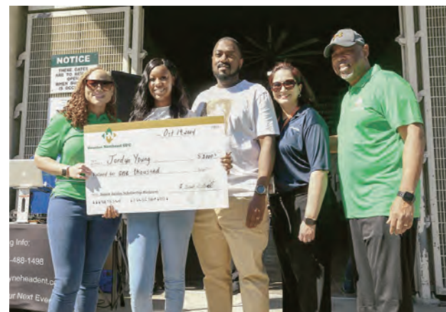
Houston Northeast CDC presented six scholarships of $1000 each.