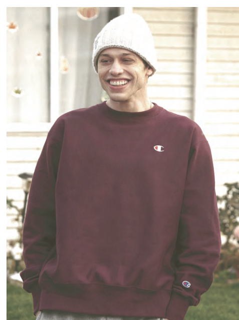
Pete Davidson ("Saturday Night Live")