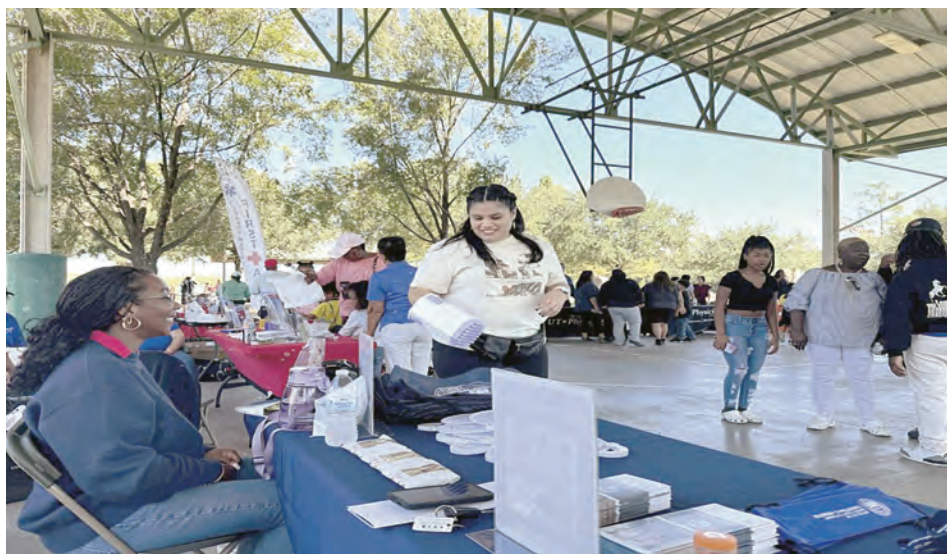
Information Booths, many with Health themes, were in the Covered Pavilion at Shady Lane Park.

If you were not able to attend the Jensen Jubilee you really missed out on such a grand Event. Hopefully next year we will get to see you there."