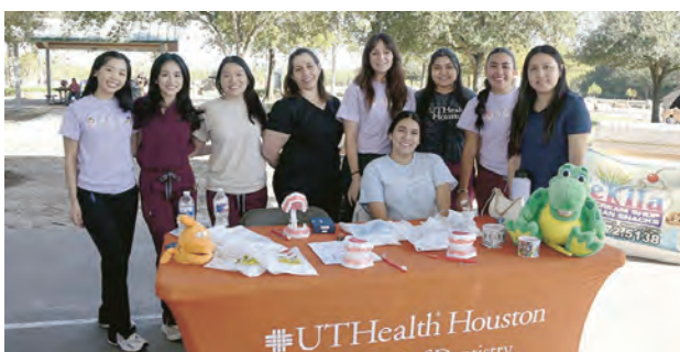
UT Health was the Title Sponsor, and was represented by Dental and Medical Staff, as well as the Jensen Clinic staff.