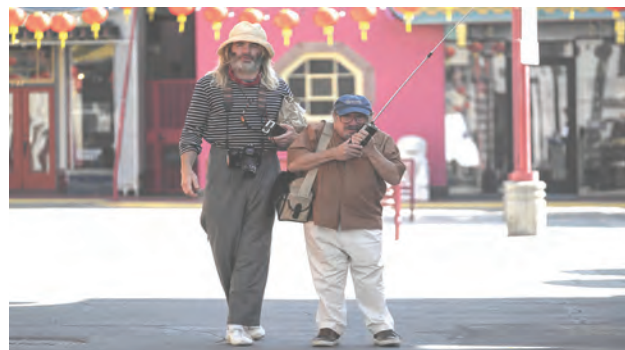
Chris Pine, left, and Danny DeVito star in "Poolman."