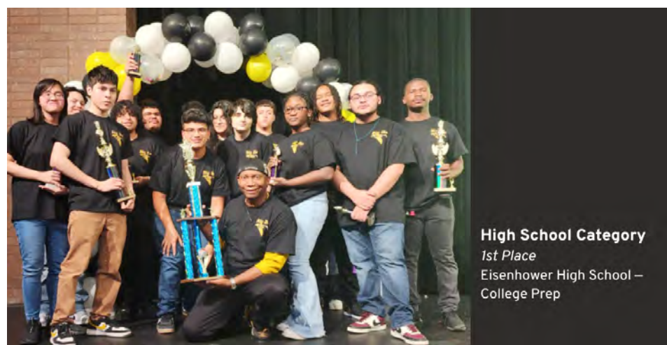
High School Category 1st Place Eisenhower High School – College Prep

Aldine ISD's chess program has become a source of pride and accomplishment, spanning 32 elementary, intermediate, middle, and high school campuses. Over the past two years alone, 16 additional campuses have joined, demonstrating the popularity of this powerful learning experience. The chess program offers students much more than the thrill of competition; it builds their mental alertness, focus, and sense of community while instilling invaluable life lessons in winning, losing, and sportsmanship.