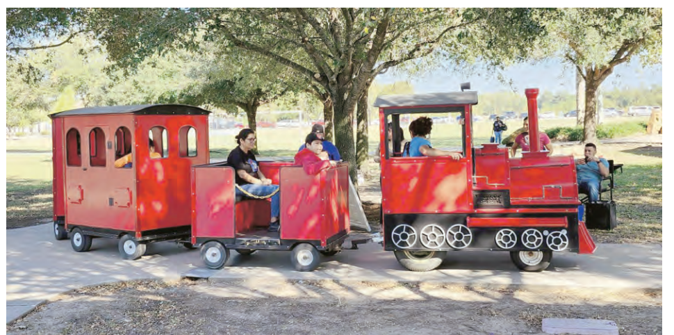
The Jensen Jubilee included kid's train rides, face painting, food, and information booths.

RECIBA RECOMPENSAS por COMPRAR LOCALMENTE compre, cene, diviértase, todo mientras apoya a su comunidad