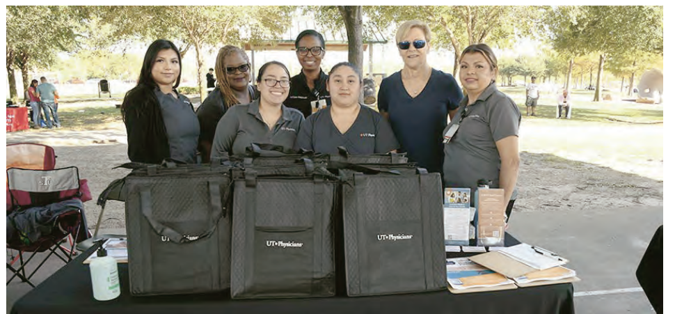
UT Physicians were present to answer questions and pass out Health literature.