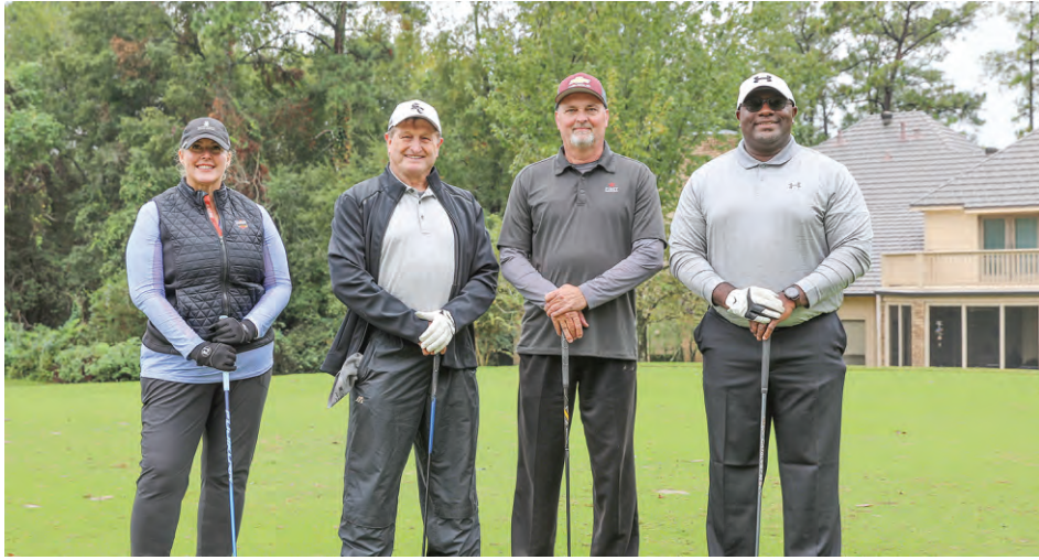
The Lone Star College Foundation Drive for Scholarships Golf Tournament will raise funds for student scholarships.

HOUSTON – Nearly 230 individuals played 18 rounds of golf at Lone Star College Foundation’s 31st annual Drive for Scholarships Golf Tournament Monday, Nov. 18 at The Woodlands Country Club. The proceeds will help fund student scholarships and educational programs.