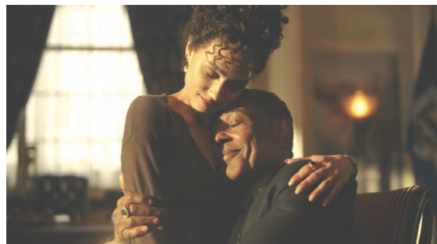
Nathalie Emmanuel and Giancarlo Esposito star in "Megalopolis."

of our dear Pogues won't be returning. (Netflix)