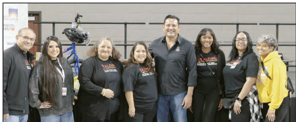
Volunteers who helped distribute the Turkeys.