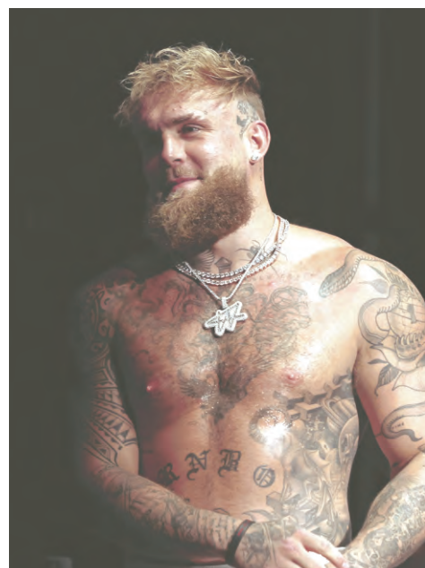
Professional boxer and YouTuber Jake Paul